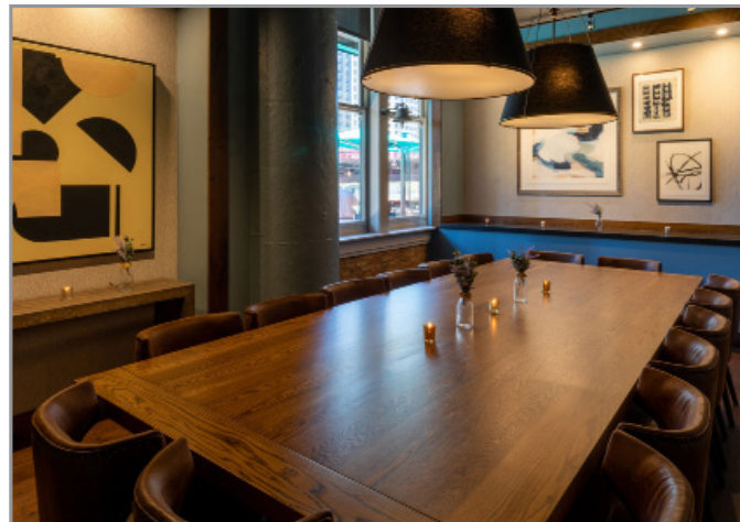
THE COMMERCE ROOM