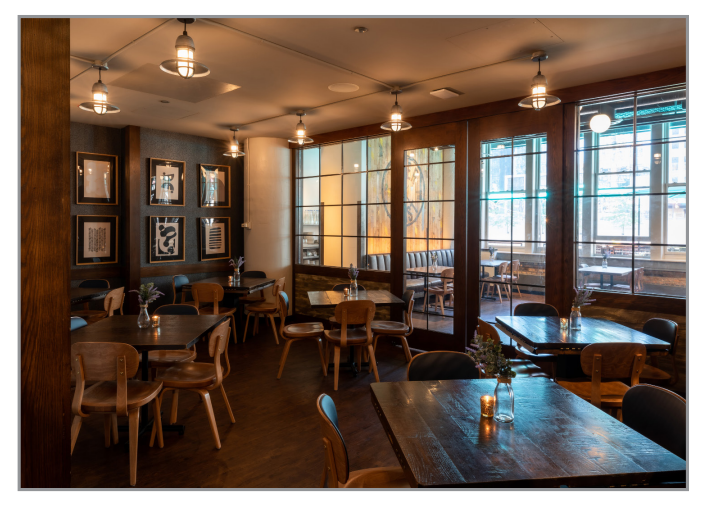
THE SEMI-PRIVATE ROOM

With 3 event spaces to choose from – each featuring sophisticated decor that pays tribute to the historical landmark building the restaurant is housed in – the options for corporate and social events are endless.