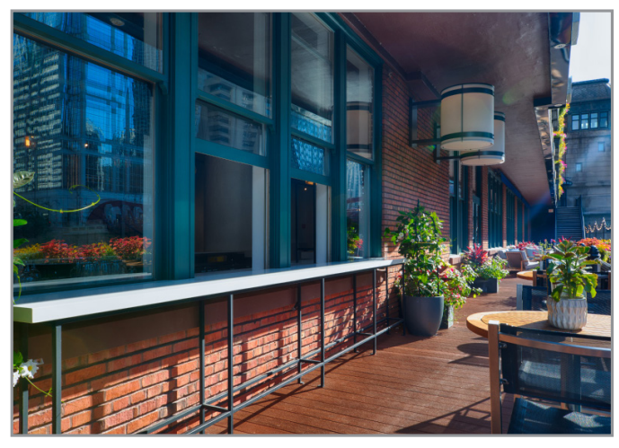
THE VERANDA CENTER