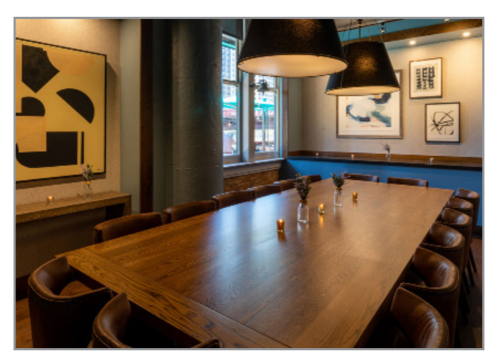
THE COMMERCE ROOM