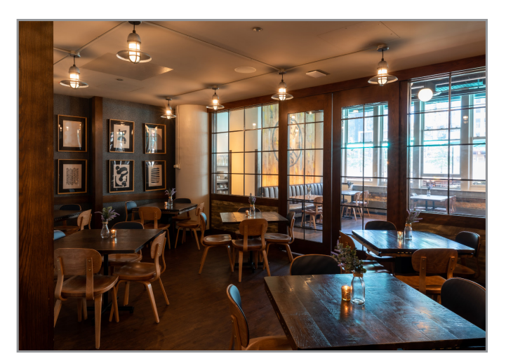
THE SEMI-PRIVATE ROOM

With 3 event spaces to choose from – each featuring sophisticated decor that pays tribute to the historical landmark building the restaurant is housed in – the options for corporate and social events are endless.