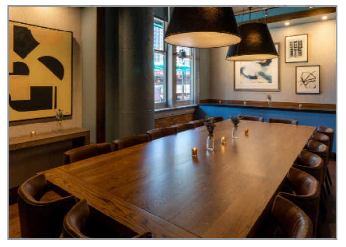
THE COMMERCE ROOM