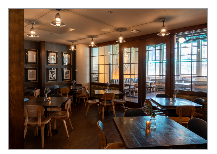
THE SEMI-PRIVATE ROOM

With 3 event spaces to choose from – each featuring sophisticated decor that pays tribute to the historical landmark building the restaurant is housed in – the options for corporate and social events are endless.