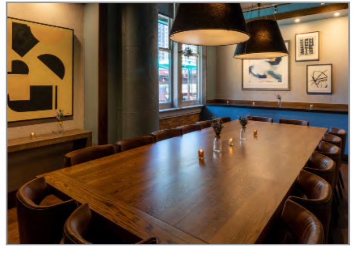
THE COMMERCE ROOM