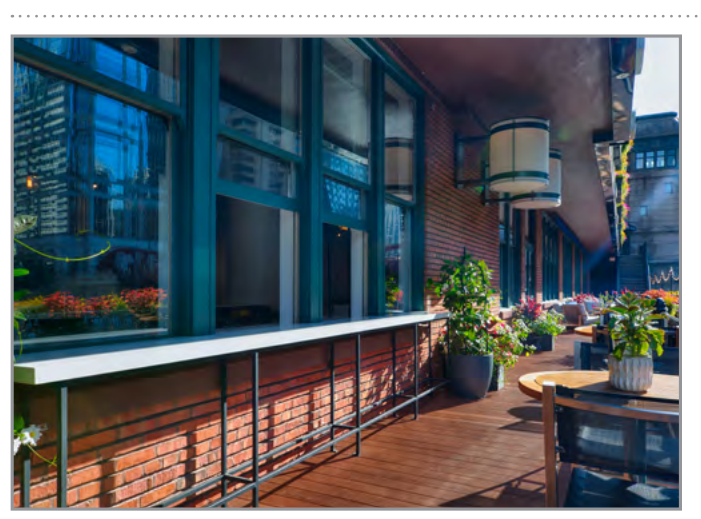
THE VERANDA CENTER