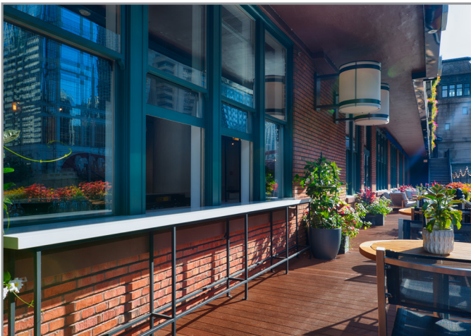
THE VERANDA CENTER