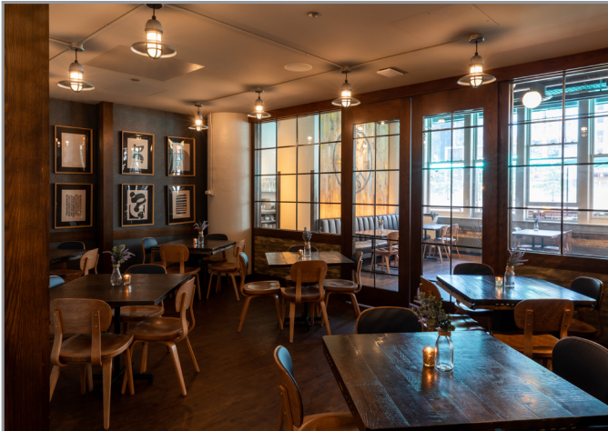
THE SEMI-PRIVATE ROOM

With 3 event spaces to choose from – each featuring sophisticated decor that pays tribute to the historical landmark building the restaurant is housed in – the options for corporate and social events are endless.