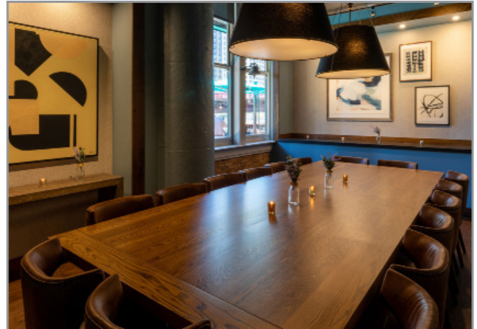
THE COMMERCE ROOM