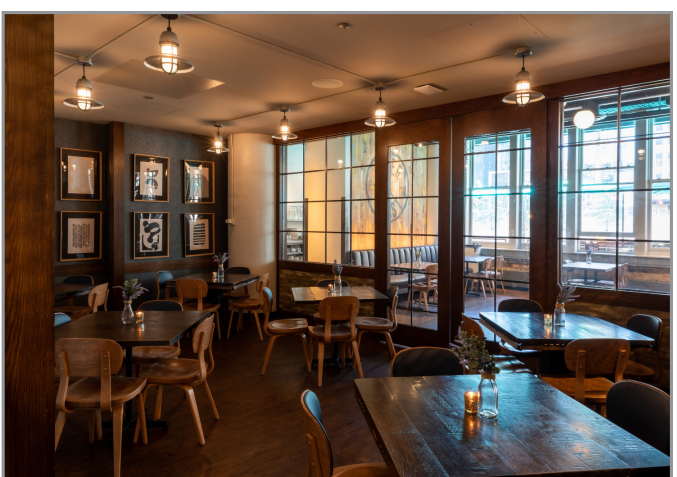
THE SEMI-PRIVATE ROOM

With 3 event spaces to choose from – each featuring sophisticated decor that pays tribute to the historical landmark building the restaurant is housed in – the options for corporate and social events are endless.